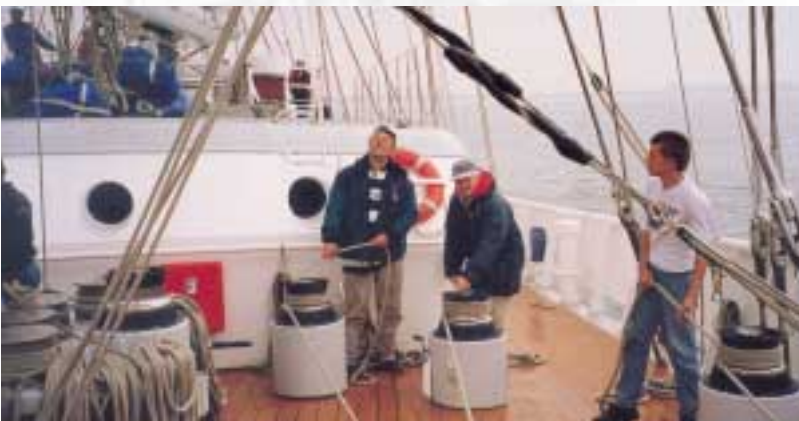
Transparently coated cork deck on the Dutch training sailing ship EENDRACHT.