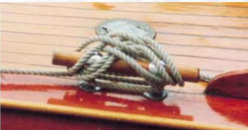
Renovated teak deck treated with pigmented primers and coated with transparent COELAN®-BOAT COATING.