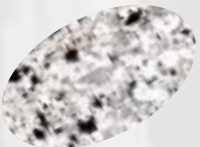
colour combination No. 101