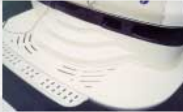
Also suitable for bathing platforms.

Plastic surfaces are also subject to heavy wear, indicated by chalky surfaces and hair cracks within the gel coat. A renovation is urgently necessary when noticing any of those symptoms. A selection of 12 hiding colours is at your disposal.