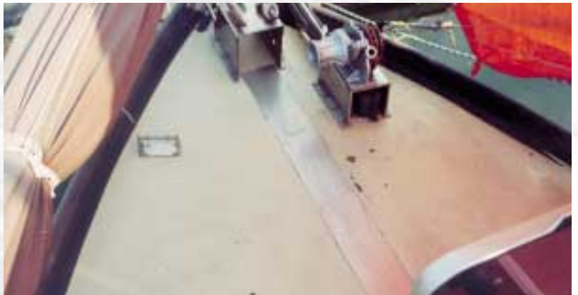
Worn steel deck.