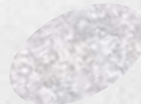
colour combination No. 105