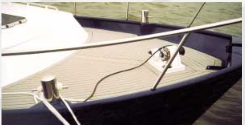
COELAN®-LAMELLAR-DECK in a teak-design.