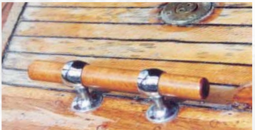
Weathered teak deck - before.