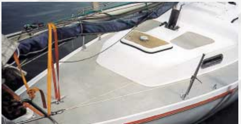
COELAN®-LAMELLAR-DECK as plane covering.

is a combination of our transparent boat coating and grey EPDM granules, applicable in teak deck design or as plane floor covering. It is slip proof and weather resistant.