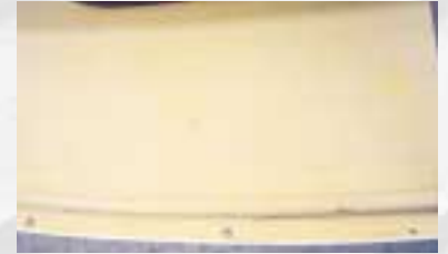
Previous state of a GRP-boat deck.