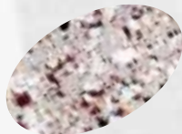
colour combination No. 103