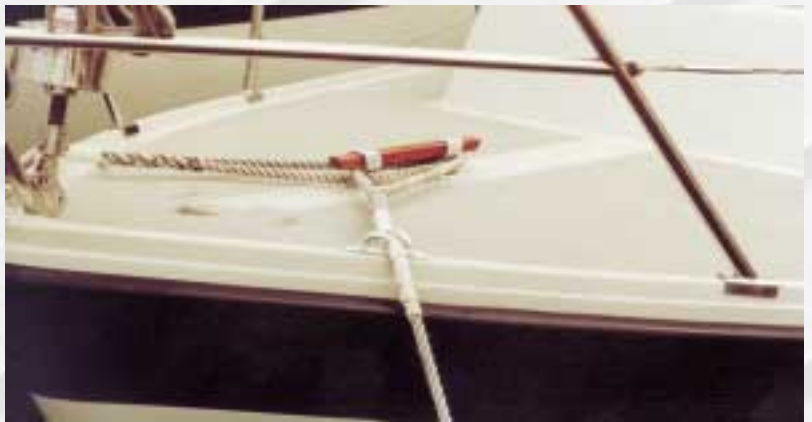
Boat deck afterwards with a white coloured coat of COELAN®-BOAT COATING. A layer of 1 mm thickness covers all of the hair cracks.