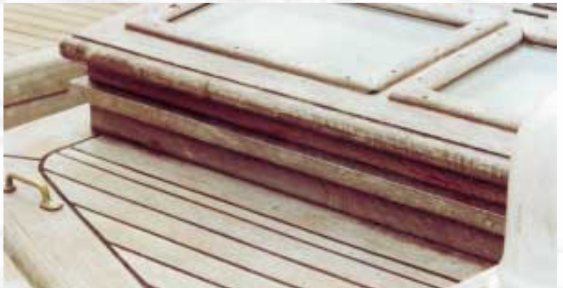
Weathered and grey teak deck.

An old boat deck looks as good as new with COELAN®-BOAT COATING.