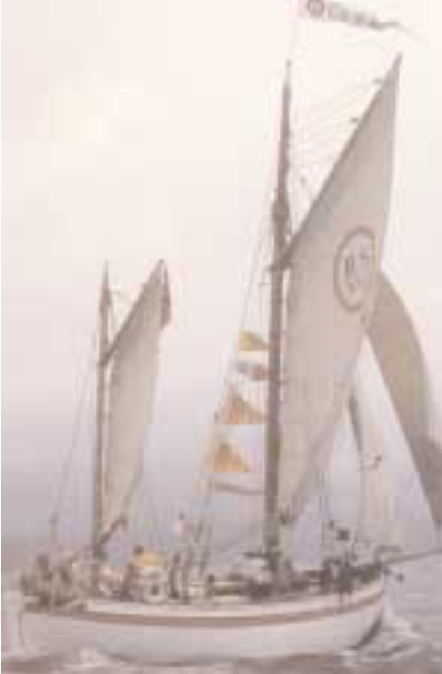
Colin Archer, Norway, uses the transparent COELAN®-BOAT COATING