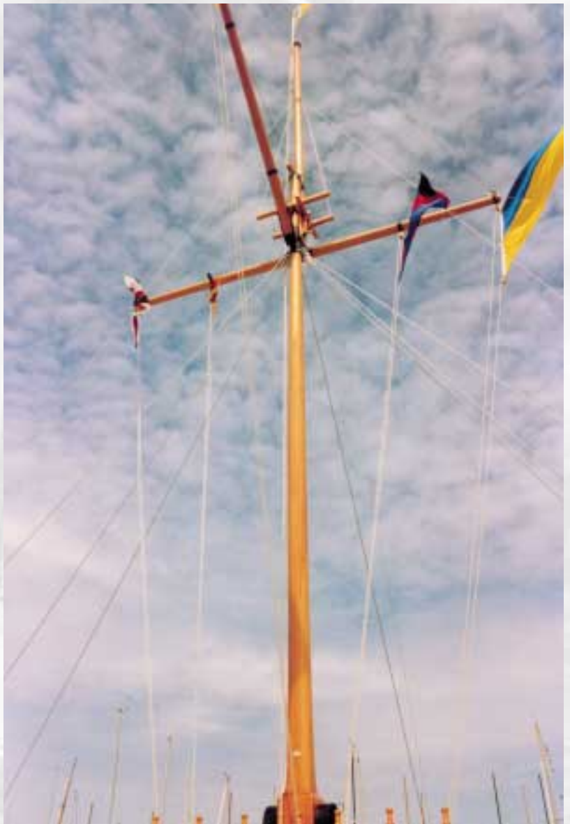
COELAN®- BOAT COATING as long-term mast protection.

Due to its excellent quality and extreme weather resistance, the COELAN®-BOAT COATING is a first class leading product, guaranteeing long life and prolonged renovation intervals.