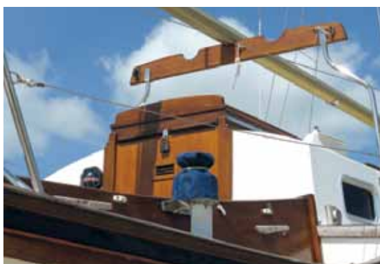
Left: Novatech on test - on the boom galleys, washboard surrounds, coamings and strakes