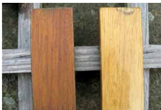
Right: Sikkens Novatech (L) and Coelan (R) after 7½ years