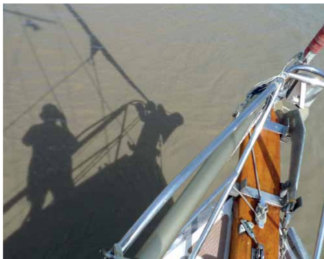
Weathering well: Coelan (flexible PU) on test boat Keppel

Totally intact on surface and all four edges. It retains a high gloss.